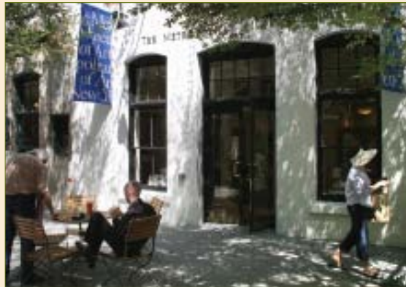
VIEW FROM SMITH ALLEY