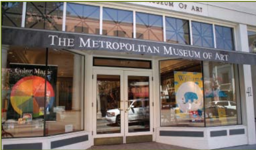
View from Fair Oaks Ave.

OLD PASADENA'S PROVEN RETAIL & ENTERTAINMENT DESTINATION